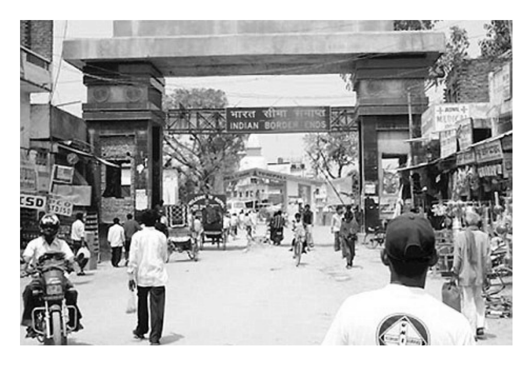
China Study Centre at Indo-Nepal border