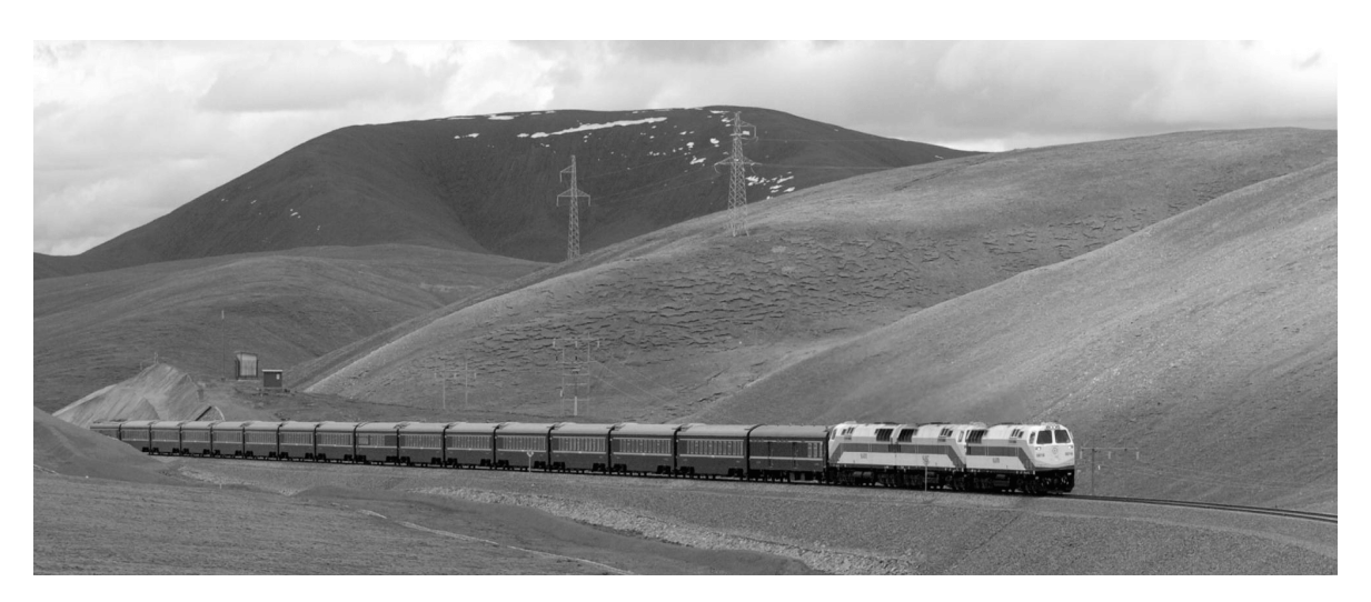
Qinghai-Tibet railway

The expansion of strategic infrastructure such as airport, railway and roads networks, bridges, dry ports and passes in Nepal provided ample evidence of China's growing strategic outreach in Nepal. Its railway and road infrastructures especially along the Indo-Nepal border will bring China very closer to Indian borders that willundermine Indian security. No doubt, India