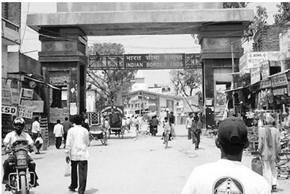
China Study Centre at Indo-Nepal border

China Radio International has also launched a local FM radio station in Kathmandu with the purpose of bringing Nepal closer to China. It has now more than 500 CRI listener's clubs and millions of listeners in the country (Jha, 2010). Smaller radio stations promoted by the Chinese have also come up in the Indo-Nepal border areas. Moreover, China has also established various schools in Nepal. In addition, various courses are offered in Chinese to the children in more than 70 schools throughout the Nepal to promote Chinese's studies. China has also been providing "volunteer" teachers to various schools in Nepal who give Chinese language lessons to Nepali students and exposure to Chinese culture.